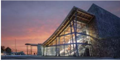
Columbia River Maritime Museum in Astoria, Oregon.

Plans to construct a facility in the City’s downtown area that will house a new museum and archives, the Teck Interpretive Centre, the Trail and District Chamber of Commerce offices and a new Columbia River Interpretive Centre are progressing well.